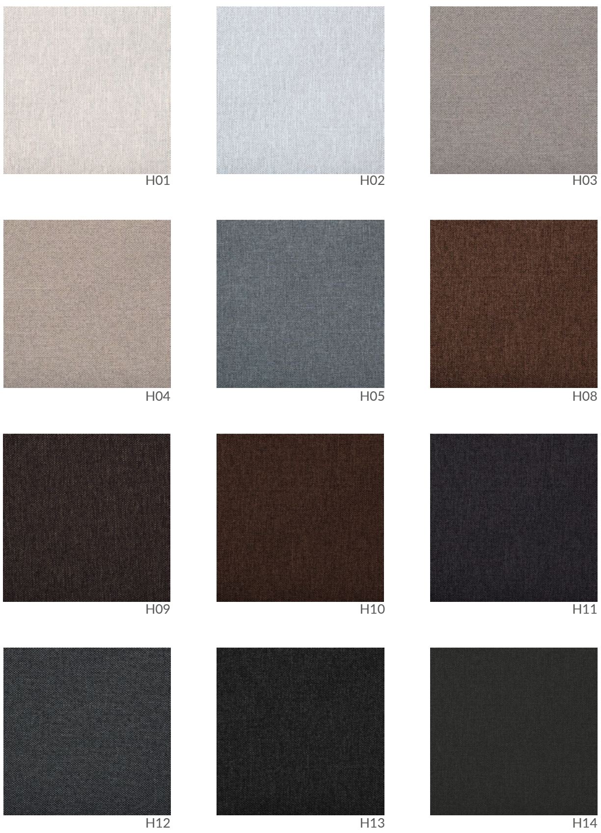
Due to the variety of veneers and various parameters and settings of monitors and graphics cards presented colors and graining may not match the actual colors and are for reference only.